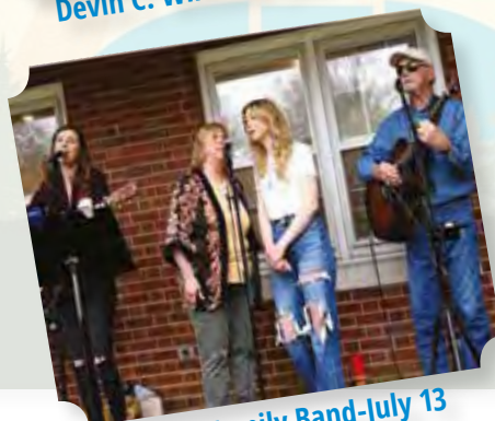
Hood Family Band-July 13