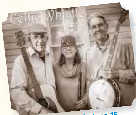
Celtic Whistle-June 15